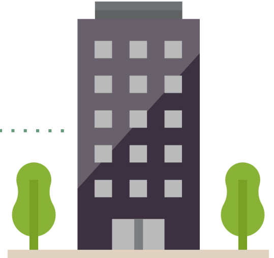
Organizations or Individuals